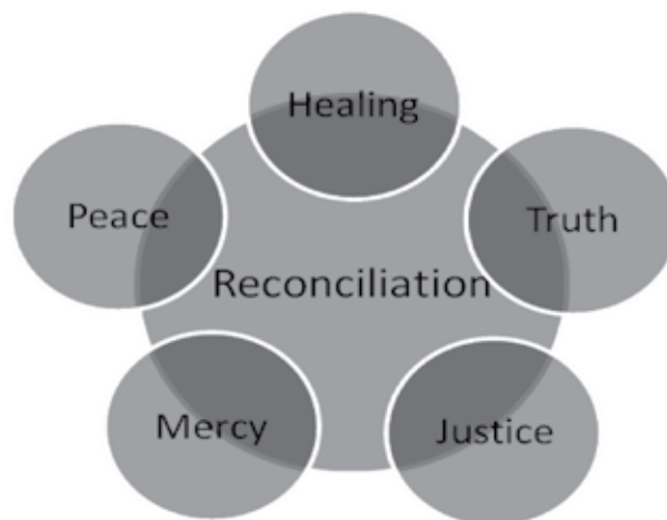
Figure 1: Integrated Components of Reconciliation

In this environment judicial mechanisms such as truth commissions and political instruments such as devolution of power would be ineffective as means of reconciliation. Objective mapping of ground realities is required to initiate the reconciliation process. In this regard, two perceptions presently prevailing among the Tamil people should be given due attention: (a) it is a Sinhalese Army (b) post-war Jaffna is an ‘Occupied Territory’. As long as these perceptions are perpetuated among Tamil people it would be difficult to reach national reconciliation. Therefore, practical and effective steps need to be taken to remove these perceptions and to convince them otherwise. In the real sense of the term, reconciliation is a broader and deeper process. As Onigu Otite states it aims to replace suspicion, hatred, animosity, stereotypes, and fear with comprehension, consciousness, sympathy, possibly forgiveness, and in rare cases, compassion. In a broad sense, Otite writes, “openness to change, flexibility, the ability to peacefully modify approaches and learn from process is what conflict transformation is all about” (1999: 10).